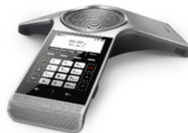
Conference Phone - CP920