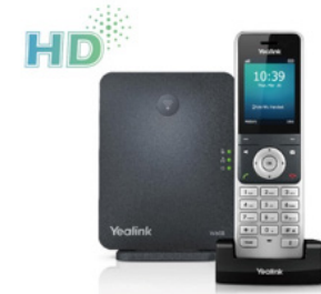
Cordless Phone - W60P