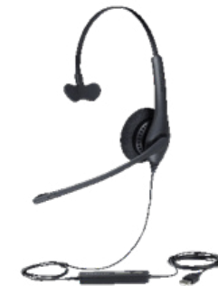
Corded Headset - Jabra Biz 1500 Duo USB

These are just a glimpse of available phones, the team will be on hand to provide a selection of devices that meets your requirements.