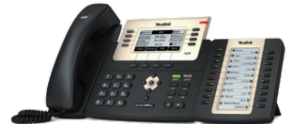
Reception Phone with Expansion Module - T27G