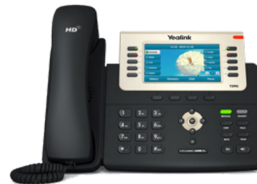
High End Color Screen Desk Phone - T29G