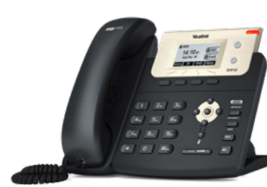
Standard Desk Phone - T21P